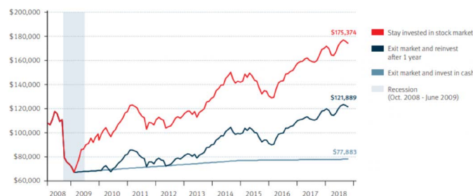
Staying invested despite market fluctuations can be more advantageous than trying to time the market.

Radically changing your investment strategy when the markets go down could result in regret down the line. It's important to reassess what your risk tolerance is (how much risk you're willing to take on your investments) and your investment horizon (the point at which you're going to need to cash in that money) and stay loyal to those beliefs.